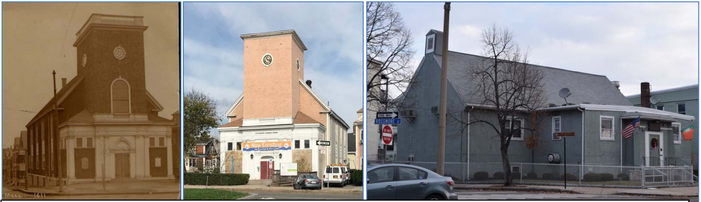
277 Broadway, Broadway Methodist Episcopal Church c. 1882 now Elizabeth Peabody House; 203 Somerville Avenue, Trinity Italian Presbyterian Church c. 1920, now Portuguese Sporting Club